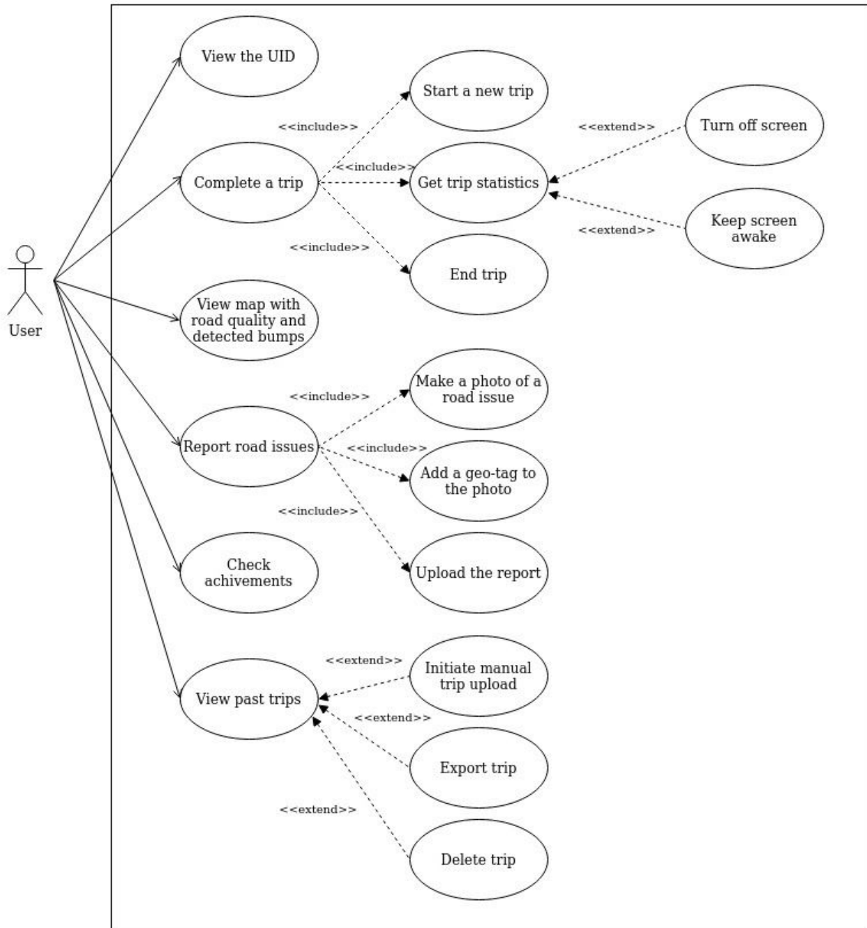
Use case diagram for Android application